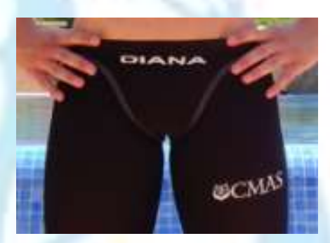
DIANA CMAS (M2/W1) CHAMPIONSHIP EPS3 - (M2/W1) FLASH

(championship FS, championship, championship metal edition) finish to sell but using authorized