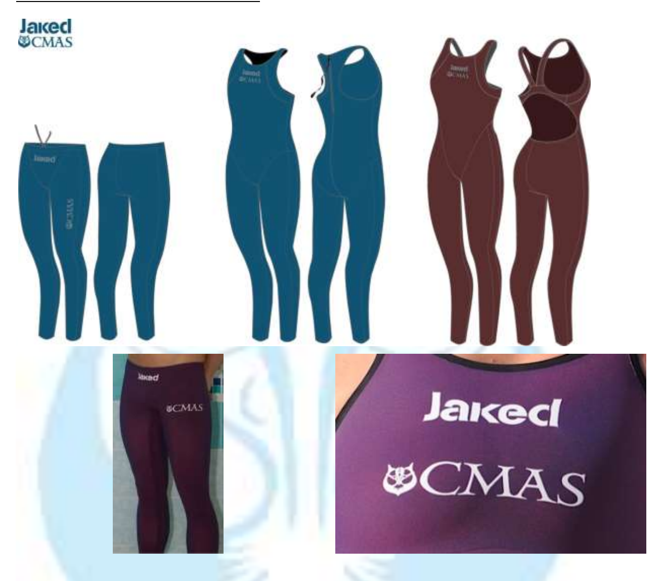
JAKED CMAS J12 MOD (M1/M2/W1) and JAKED CMAS J.RUSH (CARBON GT for CMAS) (M1/M2/W1) AS CARBON GT.